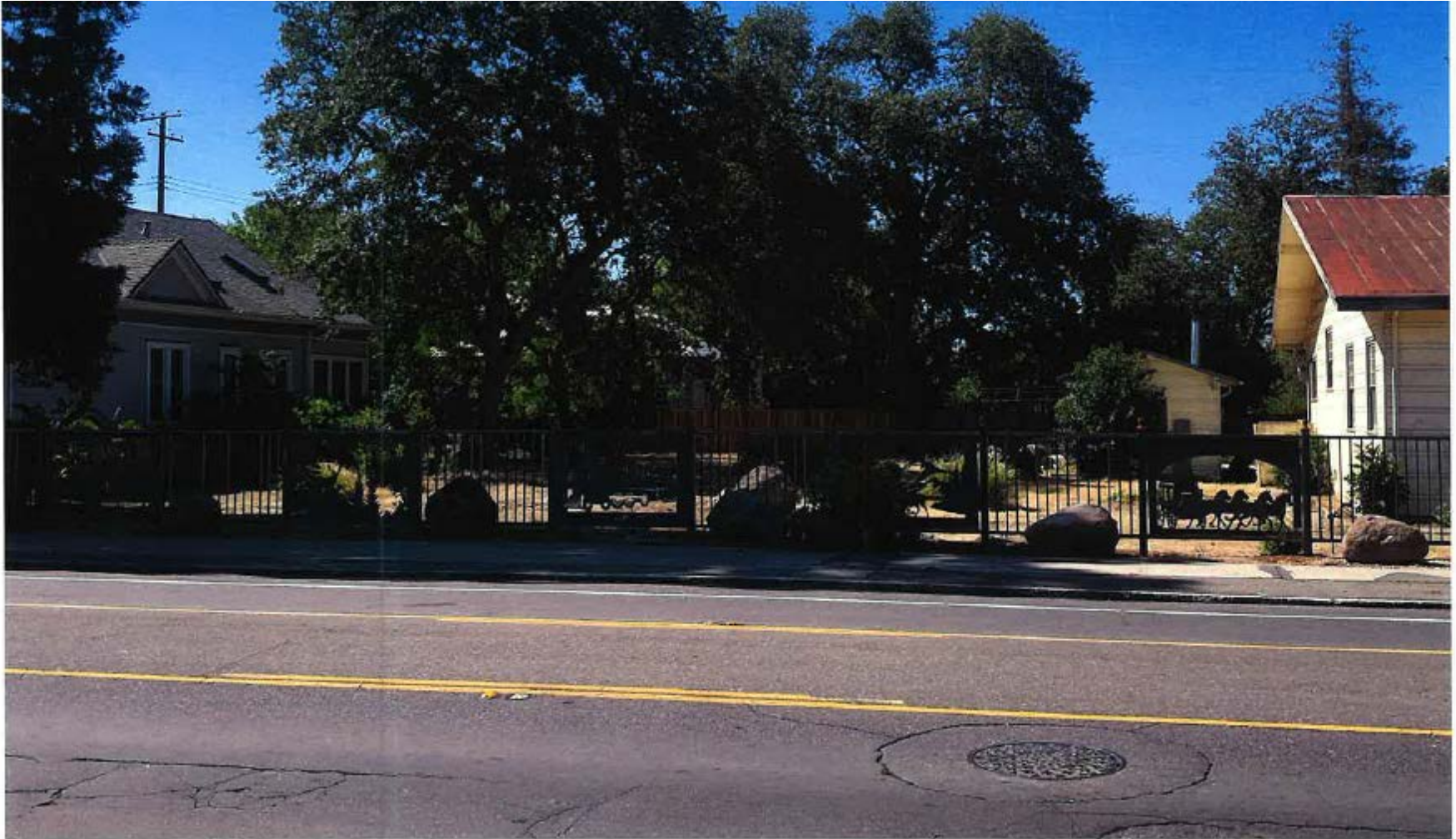
Exhibit B 8998 Elk Grove Boulevard Fence (PLNG20-021) Project Plans