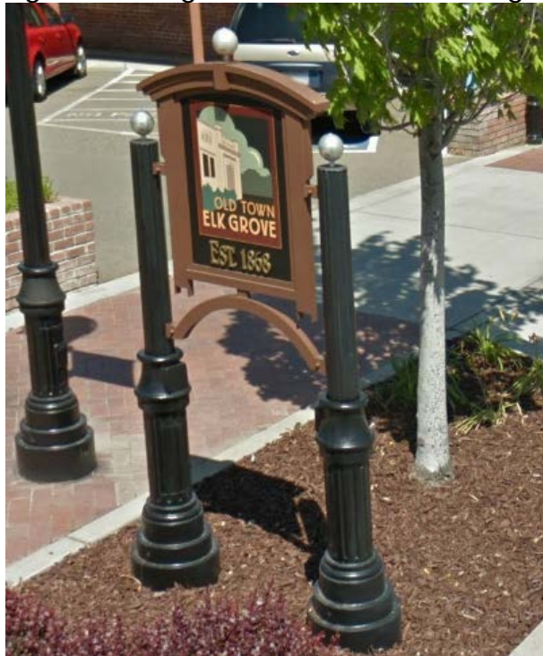
Figure 5. Existing Old Town Historic District Signs

The installation of new fences, walls, or planters at least 24 inches in height in Old Town required a Type 1 Design Review application with the review authority by the Development Services Director. As mentioned above, the fence will be a maximum height of 5 feet 6 inches tall to the top post and is a metal fence with decorative art displaying the historic characteristics of Elk Grove. The Applicant expressed that the fence will be painted a darker gray antique look. Staff believes the colors of the fence shall be more compatible with existing signage in the historic district (See Figure 5), with a color scheme of browns and blacks. Staff added a condition to the condition of approval to ensure that the fence has a color schemes as the other site design in Old Town. The Historic Preservation Committee is not the review authority for the Type 1 Design Review, only on the Major Certificate of Appropriateness.