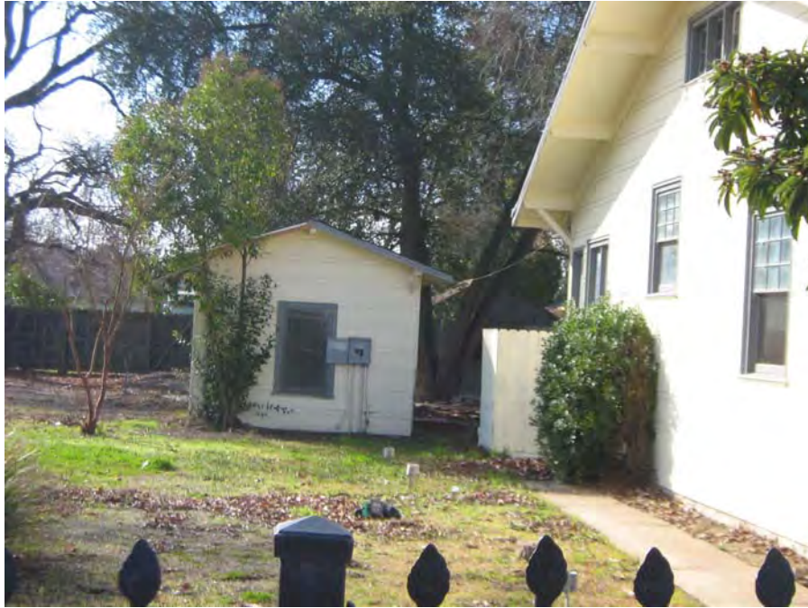
View of east facade of Traverner Residence and north facade of shed (Page & Turnbull, 02/13/2012).