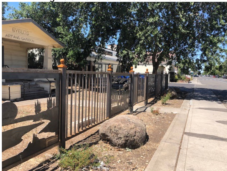
Figure 3. As-Built Elevations of Fence

A historic resource evaluation in 2012 for this property (see Attachment 2) determined that the building appears to meet the criteria for listing on the California Register listed resources. In the City’s 2019 historic resources survey and evaluation report, it was noted that site property continues to be listed in the National Register of Historic Places and is eligible for listing in the Elk Grove Register of Historic Resources and California Register of Historic Resources. The fence (See Figures 3 and 4) is considered an alteration and new addition to the historic property; therefore, a Major Certificate of Appropriateness is required.